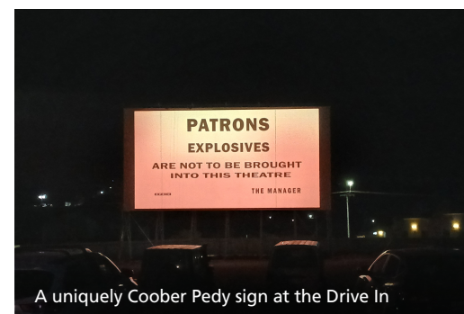
A uniquely Coober Pedy sign at the Drive In

I do SES, Dusty Radio (up to six shows already), and Drive In volunteering (both of us). We attend tennis social once a week, the Coober Pedy Together group, Park Run and so on.