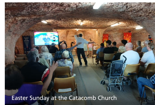
Easter Sunday at the Catacomb Church

We continue to be involved in a 'few' things. Dave has switched from CFS to SES...long story, but still great opportunities to be the God guy within the crew. Interesting point, a few members are ex-youth group members from many years ago, when they were young and single.