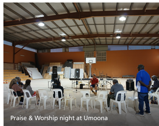
Praise & Worship night at Umoona

Again, thank you so much for praying for this ministry, we have zero chance of it succeeding without God's agency and your prayer support.. I also want to mention the partnership between the Diocese of Willochra (SA) and BCA and the ongoing backing that provides for us.