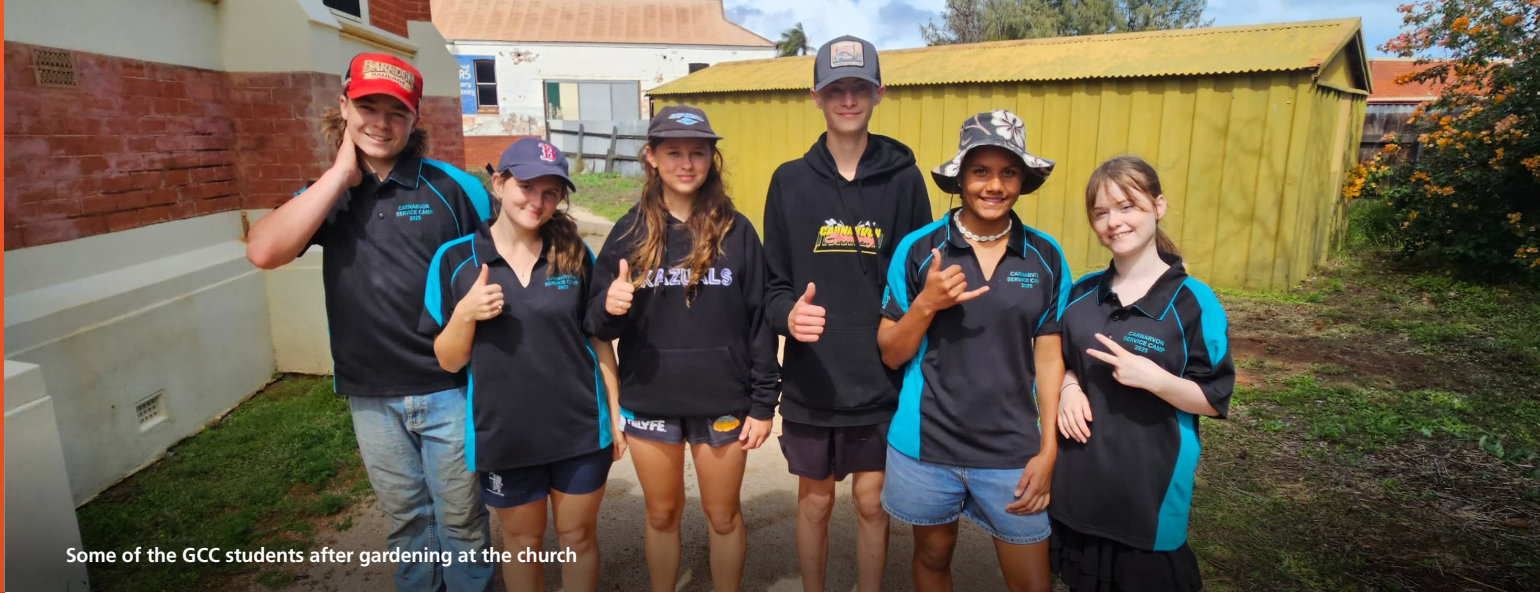
Some of the GCC students after gardening at the church