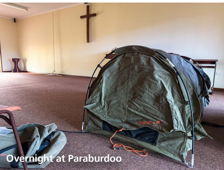
Overnight at Paraburdoo