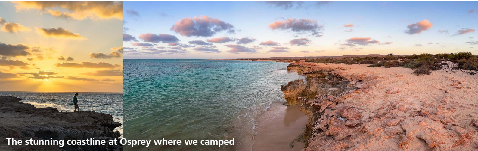
The stunning coastline at Osprey where we camped

Over Christmas Rachel, our eldest daughter, visited us and we were able to go camping for a couple of nights. The weather was very mild and we were treated to perfect days in the low 30s and cool nights. And the water was incredibly clear for snorkelling. We are very thankful when we get the opportunity to spend time with family and enjoy God's amazing creation.