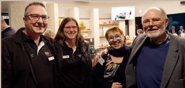
Victorian AGM 2024