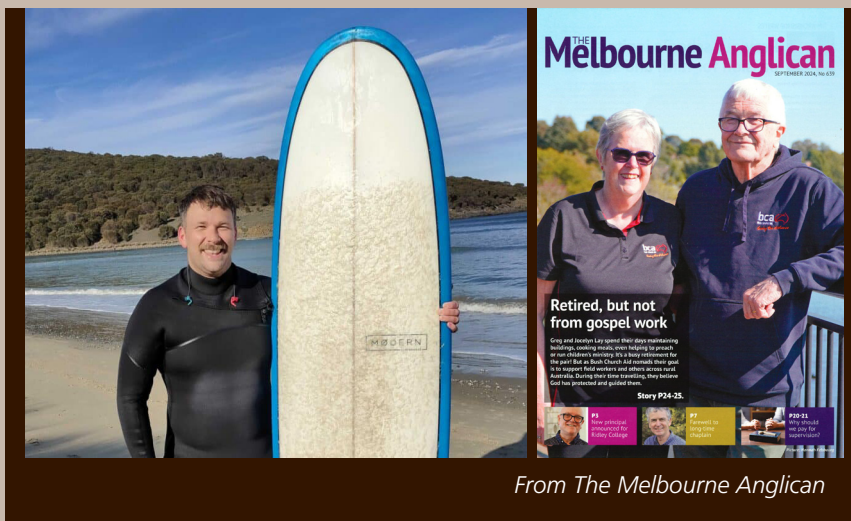
From The Melbourne Anglican