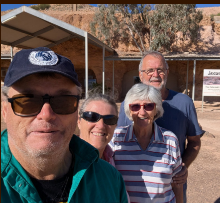
Top: Scenes from the 2025 Nomads gathering Bottom: Nomads on the road