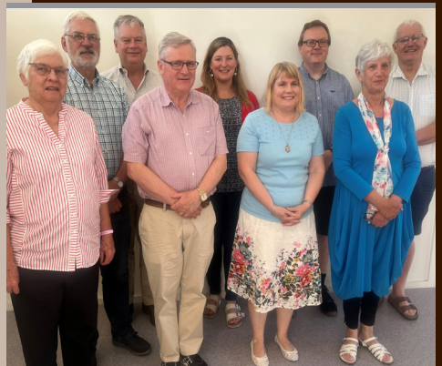
The Victorian Regional Committee

A copy of our 2023 Annual Report was sent to every Anglican parish in Victoria, together with other interested parties and supporters. This was a large and not inexpensive task. However, we received extraordinarily