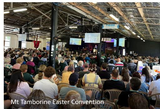
Mt Tamborine Easter Convention

The weekend after that was Easter and once again we travelled up to Mt Tamborine for Easter Convention.