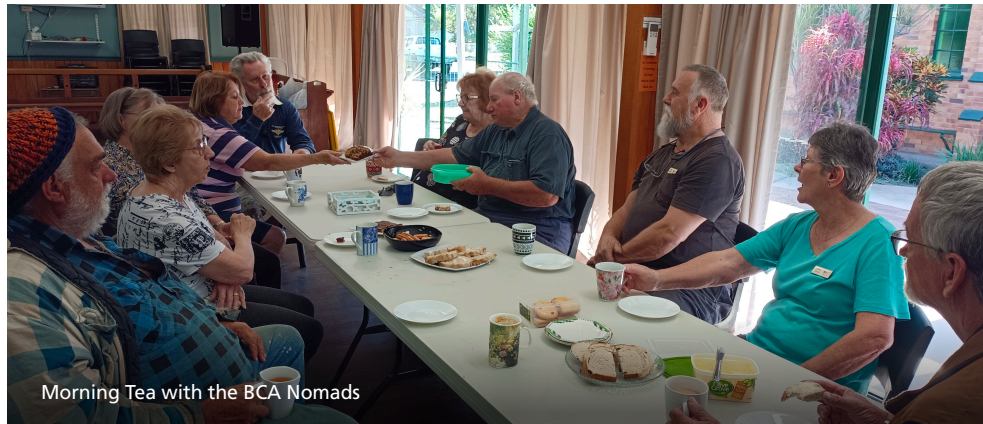
Morning Tea with the BCA Nomads