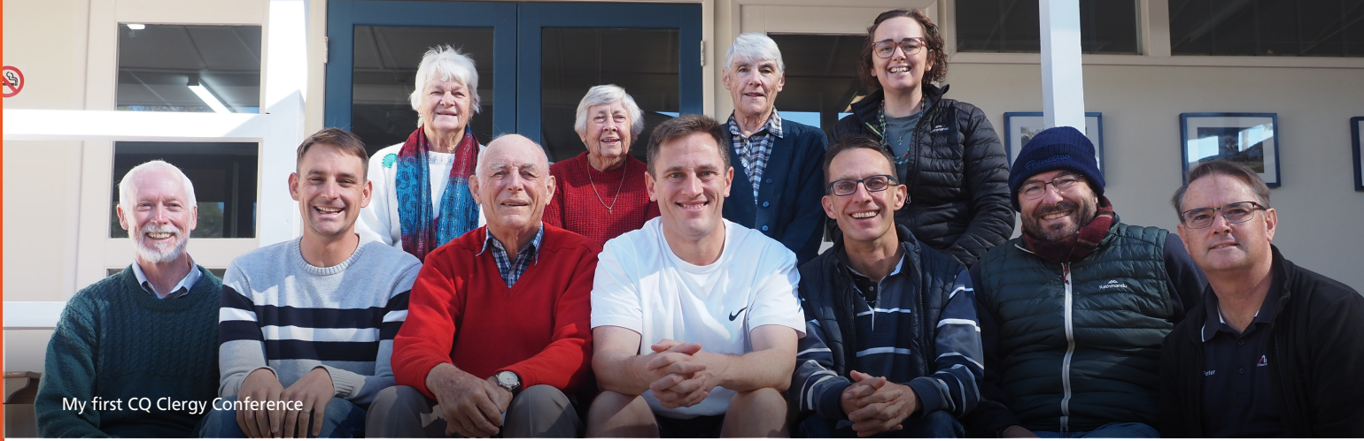
My first CQ Clergy Conference