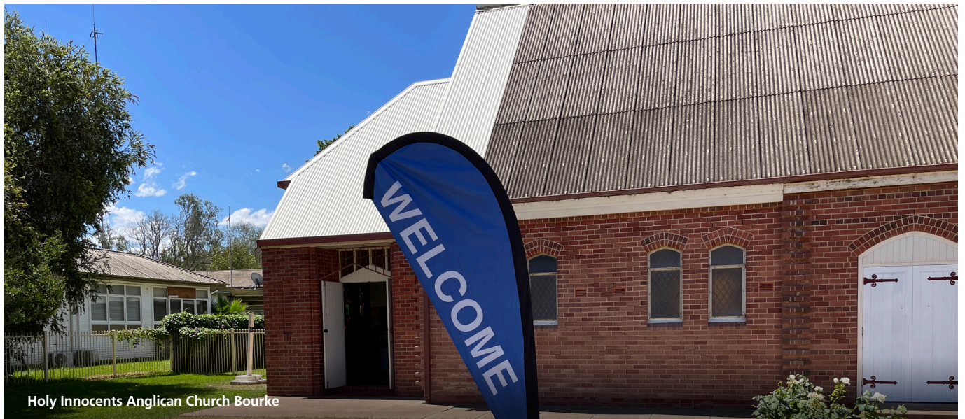
Holy Innocents Anglican Church Bourke