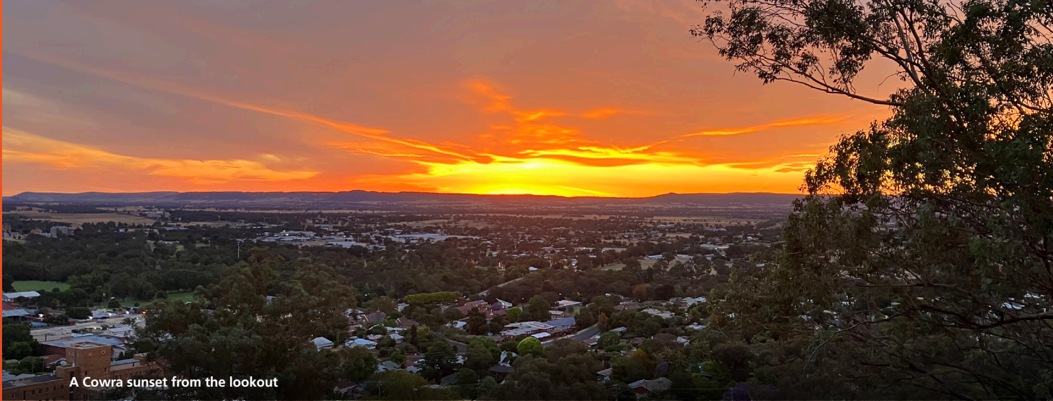
A Cowra sunset from the lookout