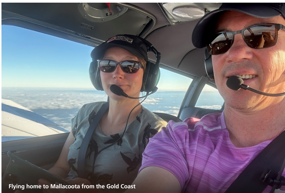
Flying home to Mallacoota from the Gold Coast

Safety on the roads and waterways, in the caravan parks and accommodation; may those travelling find peace and enjoyment in their time away. Blessing on the SUFM and Theos teams as they will be here over the New Year again.