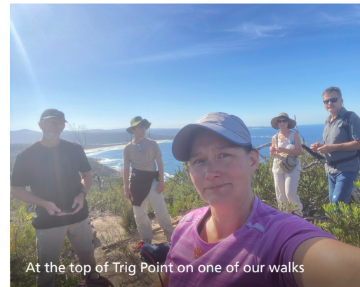
At the top of Trig Point on one of our walks

There is great enthusiasm to have another pilgrimage later in the year around Cann River at the Western end of the Parish. Perhaps