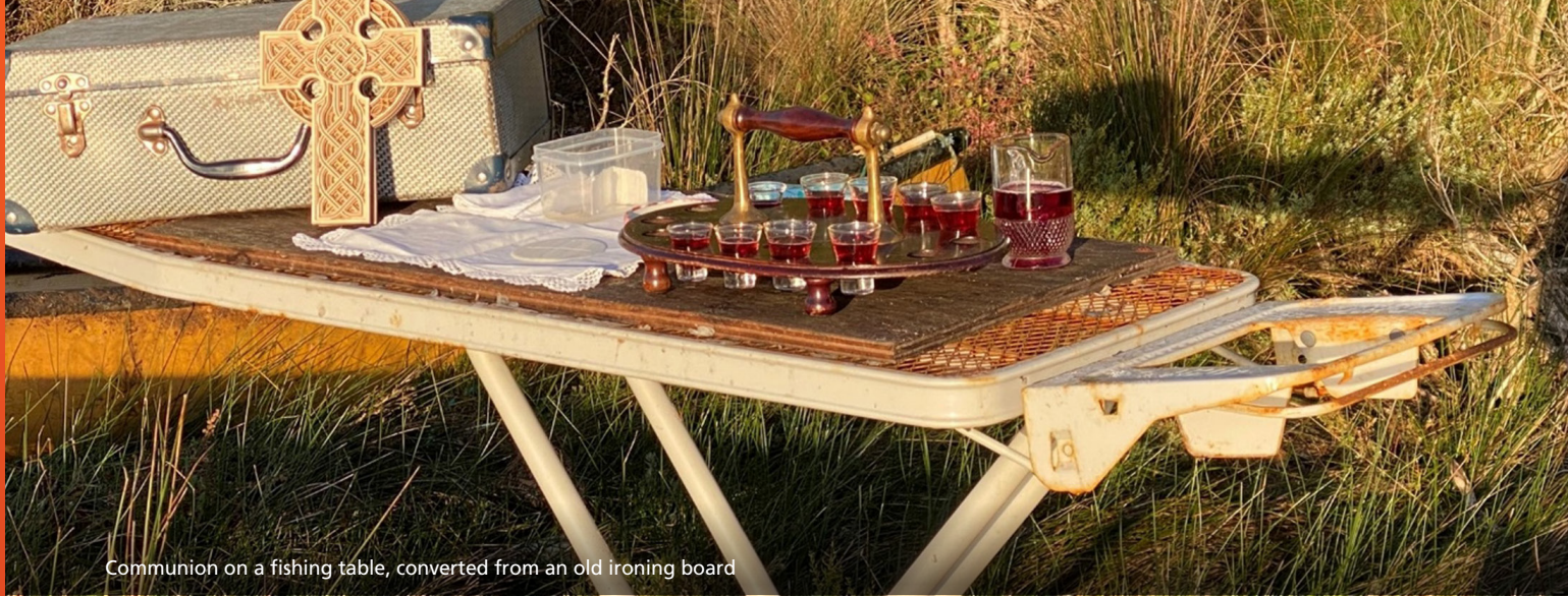
Communion on a fishing table, converted from an old ironing board