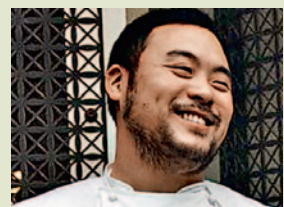
DAVID CHANG NEW YORK Arguably the best known young American chef today. Chang's eclectic approach has made him hot property worldwide. He opens in Sydney this year.