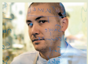
RYAN CLIFT SINGAPORE This groundbreaking young British-born chef takes modern food and cocktail pairing to new heights at Tippling Club.