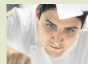
MAURO COLAGRECO FRANCE Originally from Argentina, Colagreco has taken Europe by storm. He's lauded for his elegant, seasonal cooking.