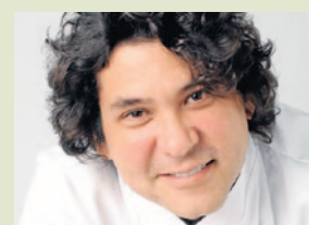
GASTON ACURIO PERU The poster chef for Peruvian cuisine, with more than 28 restaurants worldwide, and the newest South American on the S. Pellegrino list.