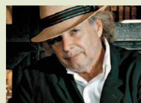
FRANCIS MALLMANN BUENOS AIRES Argentina's culinary superstar and author of the definitive Seven Fires: Grilling the Argentinian Way .