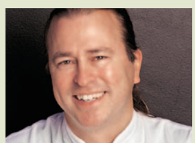
NEIL PERRY SYDNEY Champion of modern Asian and the perfect steak, he's Australia's most successful chef, columnist, cookbook author and Qantas consultant.