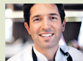
BEN SHEWRY MELBOURNE The Age Good Food Guide's reigning Chef of the Year with his restaurant, Attica, is one of only four from Australia on this year's World's Best list.