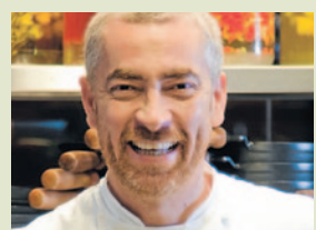
ALEX ATALA BRAZIL South America's most cutting-edge chef uses indigenous produce in his Brazilian food. D.O.M. is ranked seventh on the World's Best list.