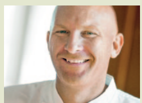
MATT MORAN SYDNEY The talent behind Aria in Sydney and Brisbane, author of two cookbooks and one of TV's most familiar chef faces, including MasterChef .