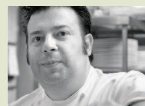
PETER GILMORE SYDNEY The culinary genius behind Quay, Australia's most acclaimed restaurant and many times winner of the Good Food Guide's Restaurant of the Year.