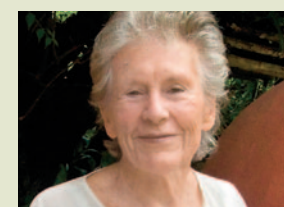
DIANA KENNEDY MEXICO This food writer is the undisputed worldwide authority on Mexican food, with books that are award-winning classics.